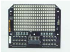
LED array that provides illumination and steerable beam