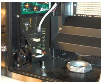
Optional Internal Stop Bar Detection Camera.