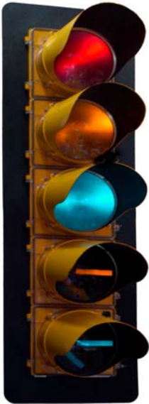
Electronically Steerable Beam traffic signal head